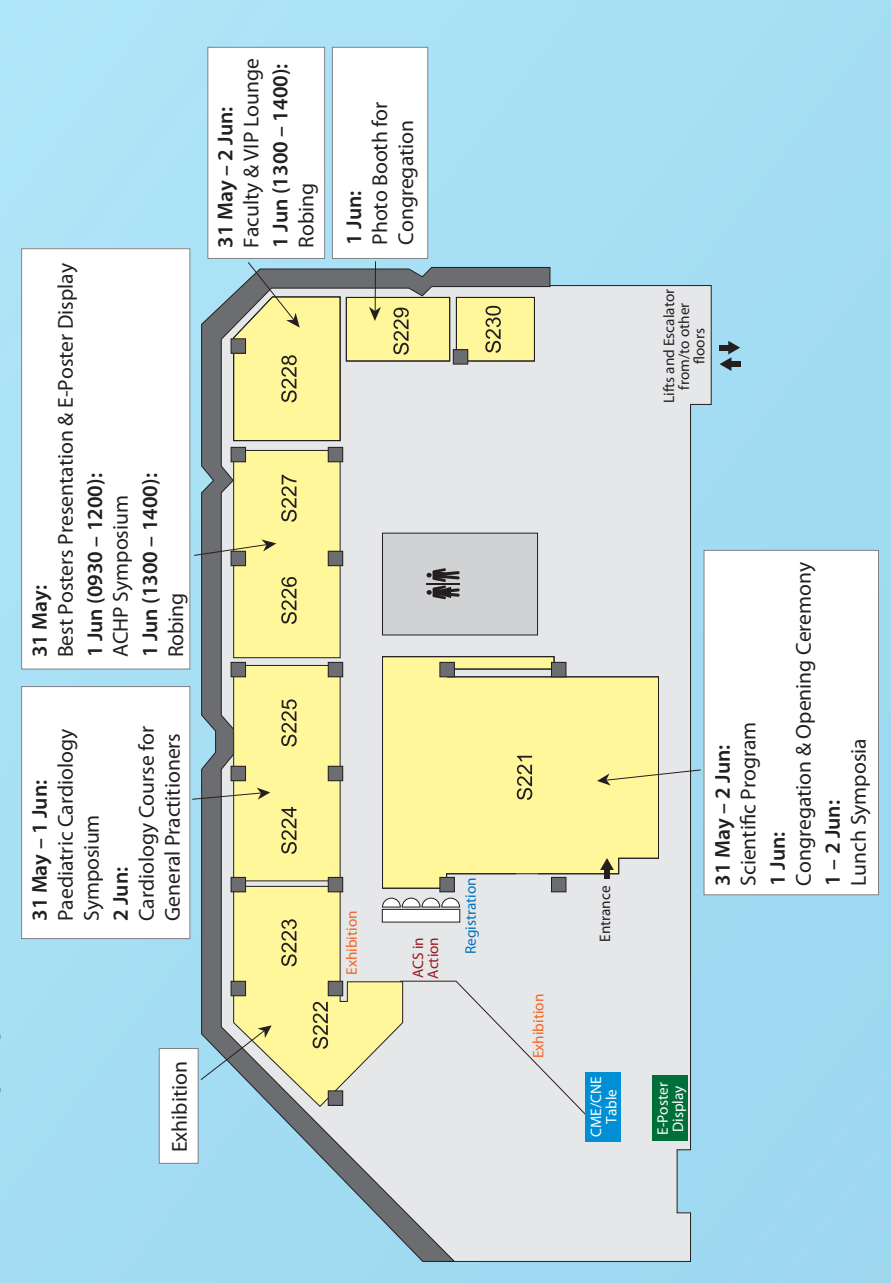
Venue: Level 2, Hong Kong Convention and Exhibition Centre